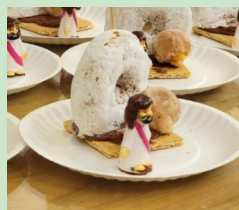
Resurrection donuts from Easter 2023

Other events over Easter will be the teen flashlight egg hunt on March 30th along with an activity. Youth group will also be selling the Resurrection Donuts on Waster morning. Please stay tuned for more information.